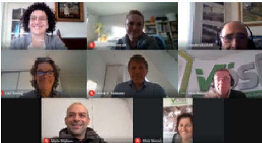
Vision Zero Environmental Guide Working Party

Thank you to all speakers and attendees who have helped to make this year long series a success. Register for our next webinar on The Importance of MSD Awareness on the 15th December 14:00 - 15:00 (CET) here .