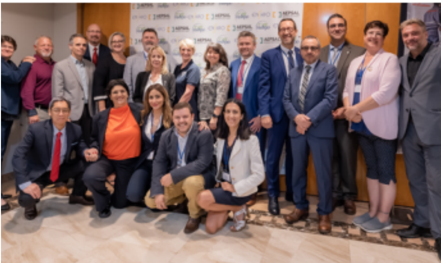
AEPSAL and INSHPO members in Barcelona, October 2022

On the 3rd and 4th October, ENSHPO member AEPSAL, with our support, hosted the INSHPO Annual Meeting in Barcelona. Following two productive days of meetings and good practice sharing, on the 5th of October attendees came together to celebrate an International forum with the participation of ILO and EU-OSHA. Participants heard about the present and future of Health and Safety, what differentiates us from one country to another and what aspects are common to EHS professionals at a global level. An event born out of true collaboration, representatives from the INSHPO Professional Associations throughout the 5 continents brought together an opportunity to share knowledge of what our profession is like at a global level, all the while never losing sight of national character - a valuable occasion arranged by Health and Safety professionals, for Health and Safety professionals.