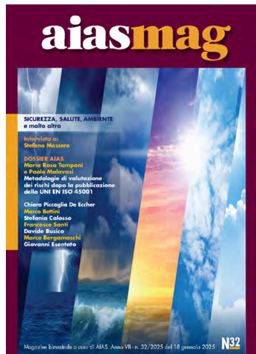
SICUREZZA, SALUTE, AMBIENTE E MOLTO ALTRO ANNO VII N. 32, 18 GENNAIO 2025

To read past issues, visit IOSH magazine - Safety, Health and Wellbeing in the world of work