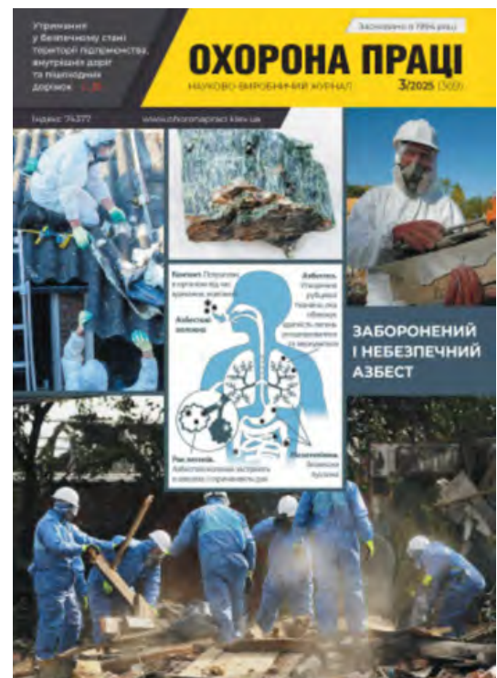
OCCUPATIONAL SAFETY 3/2025