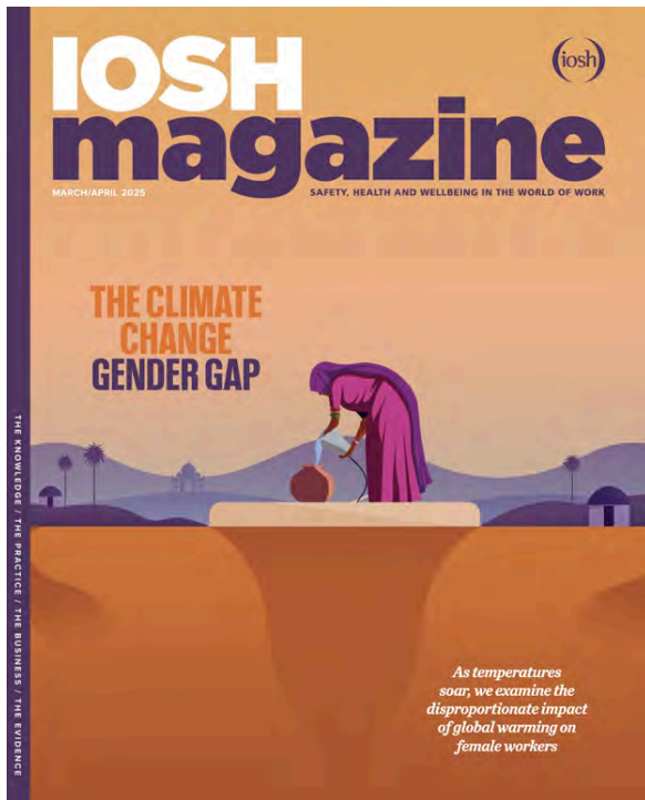
IOSH MARCH/APRIL 2025

Read more from ENSHPO member, IOSH, in their bi-monthly magazine.